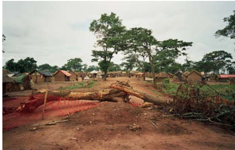
Next to the TFM plan zone, the entrance has been blocked to what is left of Mulumbu village.

PACT-Congo has been creating small firms to produce these bricks and fences. On April 11, 2007, a