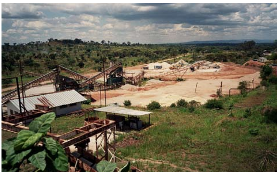
A stone crushing installation (front) stands idle, while TFM has ordered to build a brand new one (back).