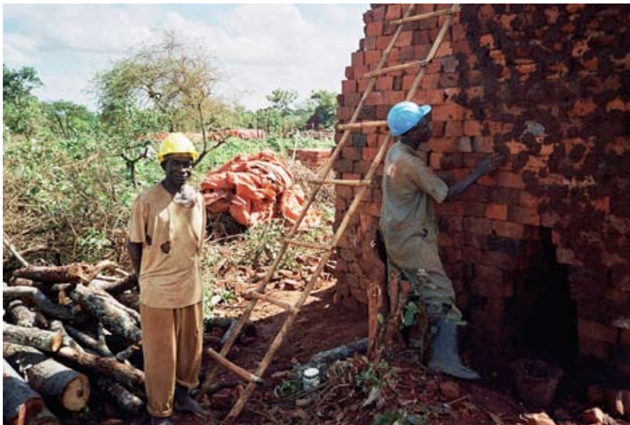
As part of TFM's social program, bricks are being made for houses at Fungurume.

During a “Question & Answer” session in May 2006 with representatives of the Kolwezi authorities a higher amount of money was mentioned for the development fund; some US $2.7 million, which was considered by the local residents to be “far from enough”. TFM representatives replied that this figure had been given to illustrate the functioning of the fund and the contributions to the fund will depend on the metal prices on the world market and the production level in a given year. 187