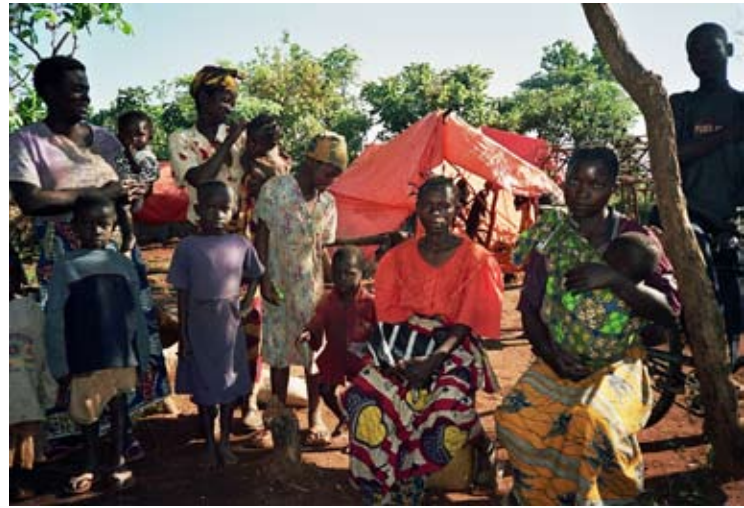
People who have been resettled from Mulumbu villaged are living like refugees under plastic sheetings in October 2007.

The DR Congo needs foreign investments to be able to generate money from its natural resources. The so called “resource paradox” continues to characterise the country. Despite the abundance of valuable minerals, the majority of the people continue to live on less than a dollar per day. There are several reasons for this, such as the colonial and neo-colonial heritage, widespread corruption, recent armed conflicts and, the inability to assure that a substantial share of the income generated by mining remains in the country and - most importantly – that the income is being redistributed to the Congolese people.