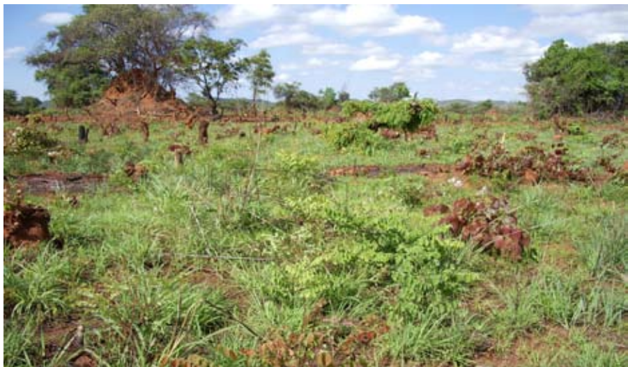
Tenke Fungurume Mining has given this plot of land to the resettled farmers from Mulumbu village. As it is filled with tree trunks, it is very expensive to cultivate.

Driving into the town of Fungurume, the first stop on the left is Schekilah's restaurant, just meters away from the market. On the right, a road leads to the railway station and the Catholic Church of Saint-Jacques. At the far end of town, Fungurume's Main Street goes north and leads to the airstrip of TFM and the Lukotola mission, some 20 km away.