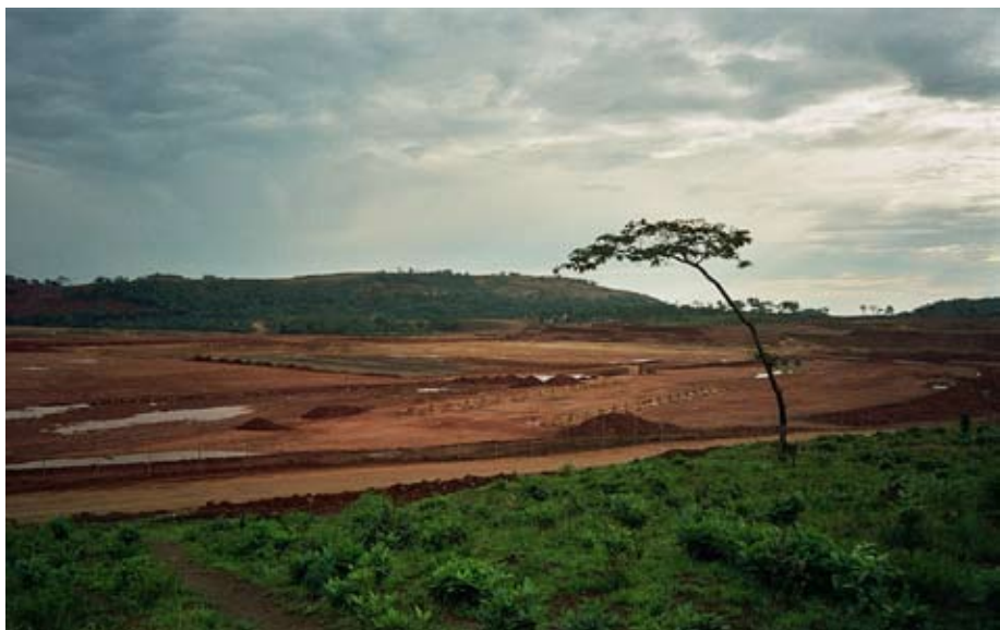
Tenke Fungurume Mining has levelled the zone where it plans to build the processing plant