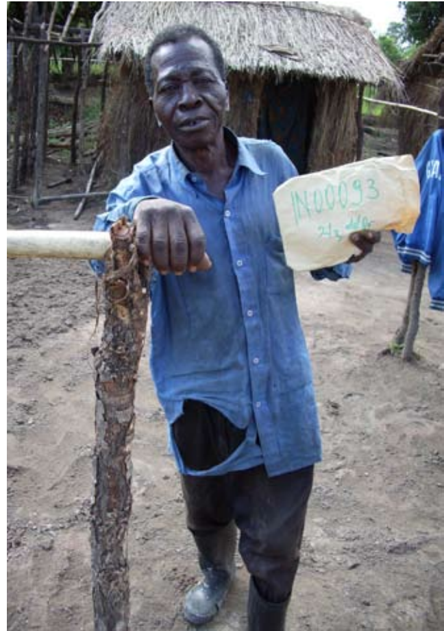
A man shows the resettlement contracts signed with Tenke Fungurume Mining.

The commission started its work in June 2007. Its members came from different government administra-