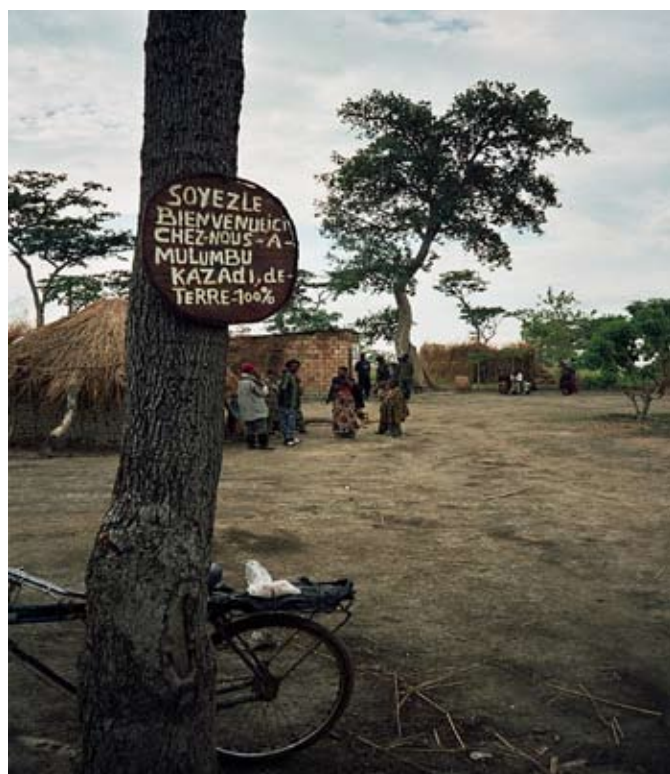
Mulumbu village, along with the neighbouring Amoni and Kaboko villages, have to disappear to make way for TFM's processing plant.

TFM made the decision to resettle these villages, give them new plots of land and compensate them for their loss of in-