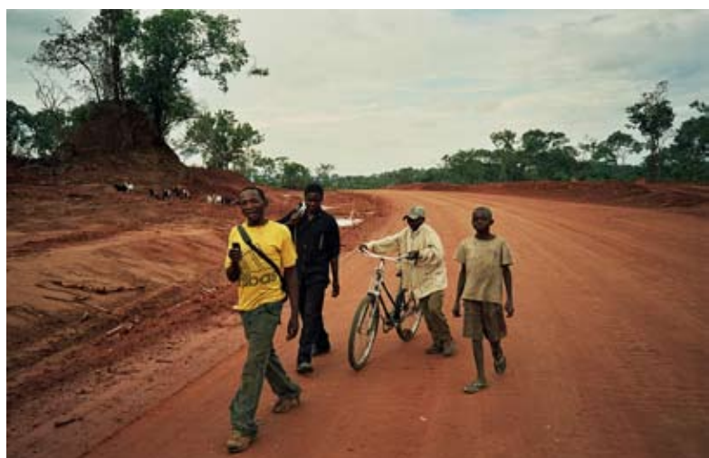
Tenke Fungurume Mining constructed extremely wide roads within its concessions.

Lundin never began mining. In February 1999, the company announced that the war made every mining activity impossible and it invoked 'Force Majeure'. Information also indicates that Tenke Mining Corp. lacked the money needed to proceed since financing from international banks disappeared when the war started. The reasons for halting the project have been questioned, but the Congolese state and Gécamines did not contest the Force Majeure that was lifted only in 2005. Because of the events, some of the DR Congo's richest mineral assets were untouched for almost ten more years.