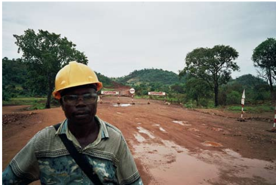
Within the TFMining concession, major road works continue.